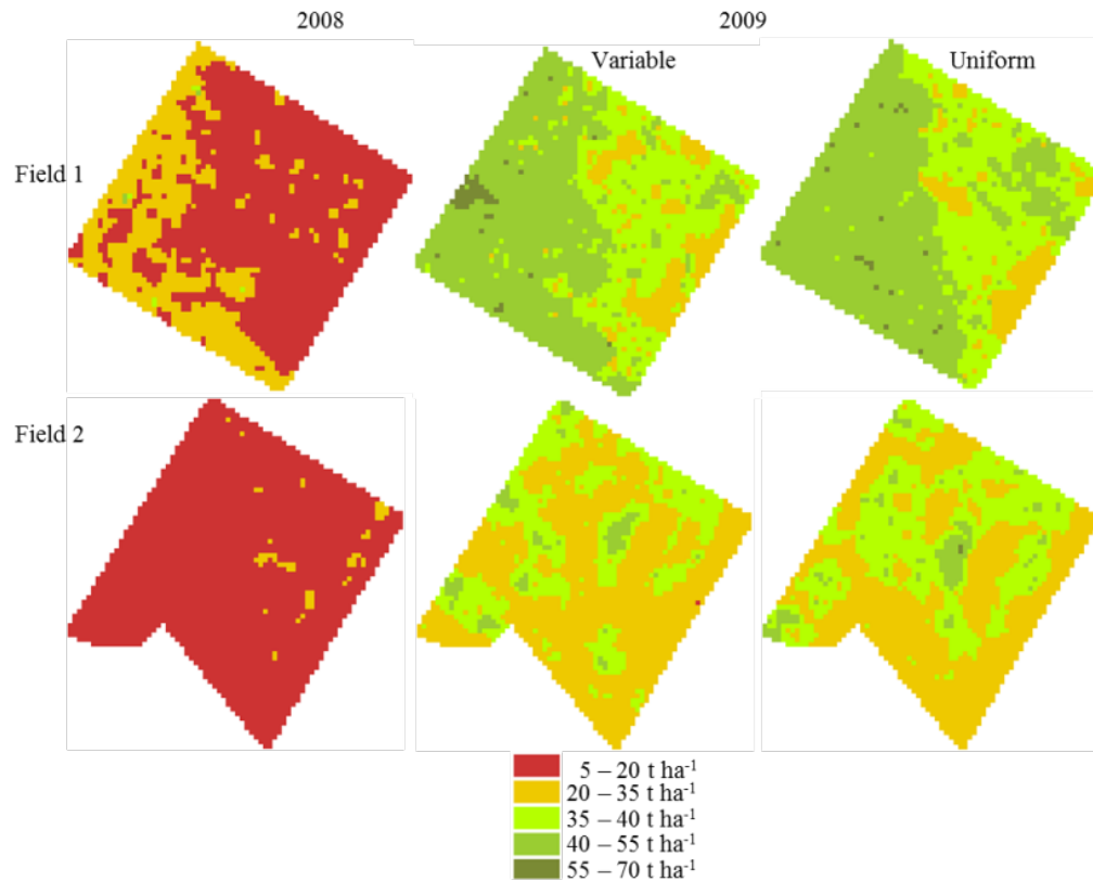
Fig. 3. Orange yield maps before treatments implementation (2008) and after variable and uniform fertilization (2009).